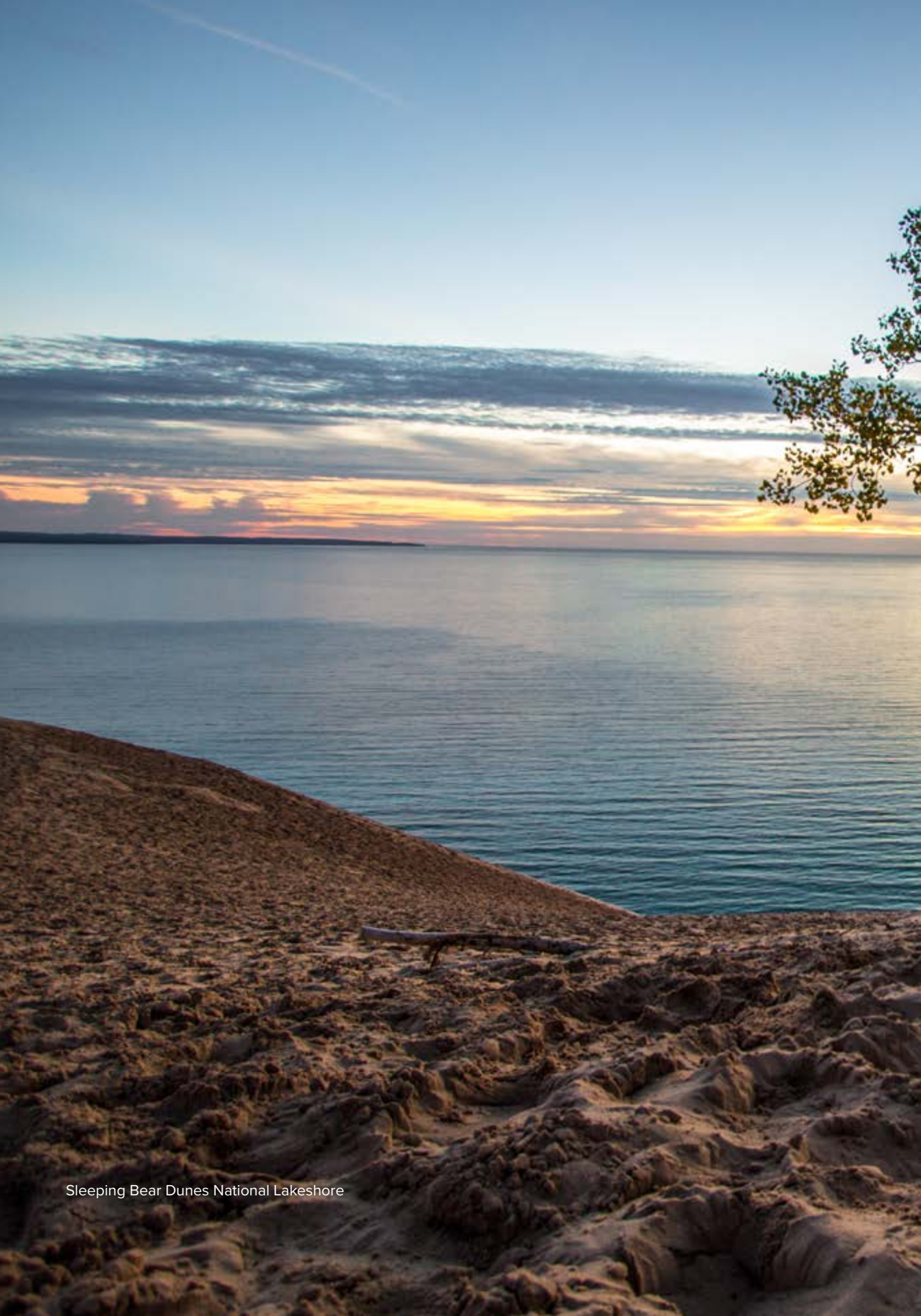
Sleeping Bear Dunes National Lakeshore