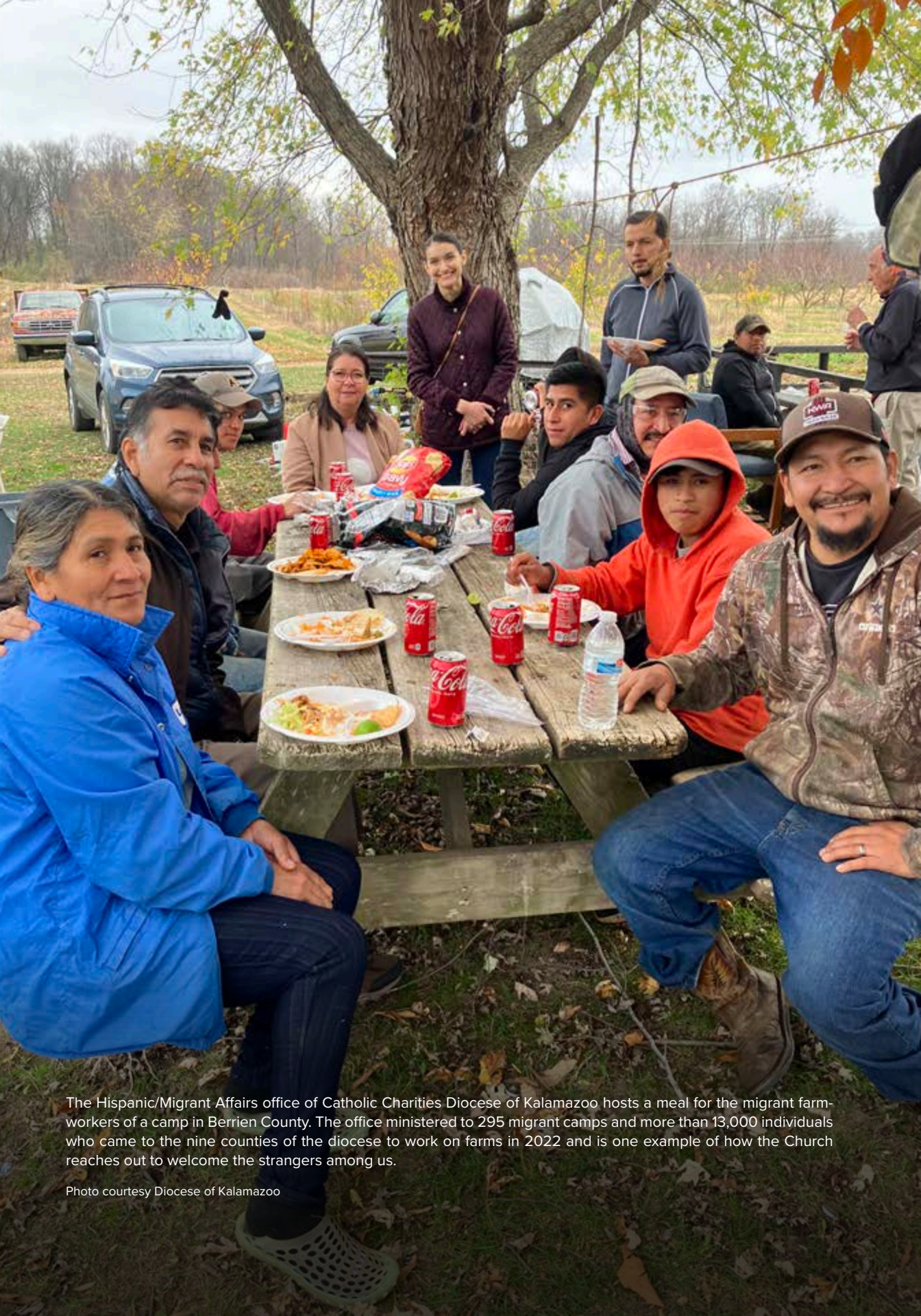
The Hispanic/Migrant Affairs office of Catholic Charities Diocese of Kalamazoo hosts a meal for the migrant farmworkers of a camp in Berrien County. The office ministered to 295 migrant camps and more than 13,000 individuals who came to the nine counties of the diocese to work on farms in 2022 and is one example of how the Church reaches out to welcome the strangers among us.